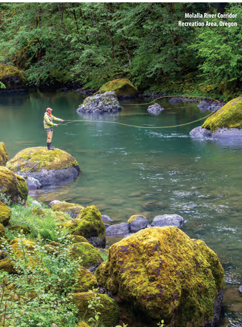
Molalla River Corridor Recreation Area, Oregon